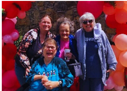
*More photos will be posted on Pacesetters Facebook page.