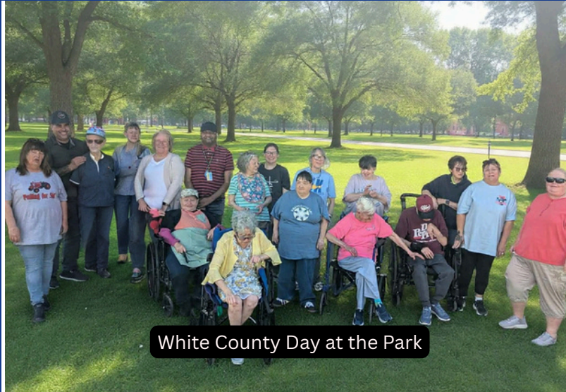
White County Day at the Park